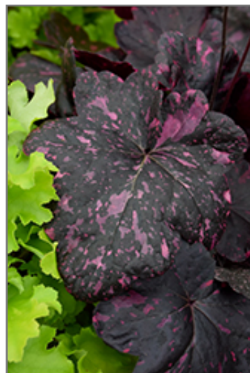
Midnight Rose Coral Bells foliage

Midnight Rose Coral Bells is recommended for the following landscape applications;