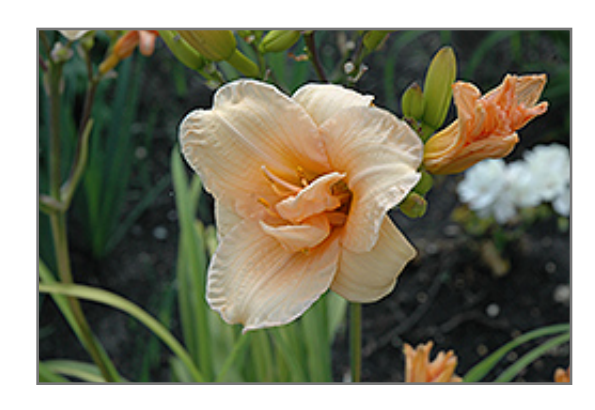
Bubbly Daylily flowers

Lovely, miniature daylily with pale apricot trumpets that may show as double in the heat; most valued for an abundance of blooms; sturdy, strong, easy to care for, great grassy texture and form; good for the beginner gardener and the pro