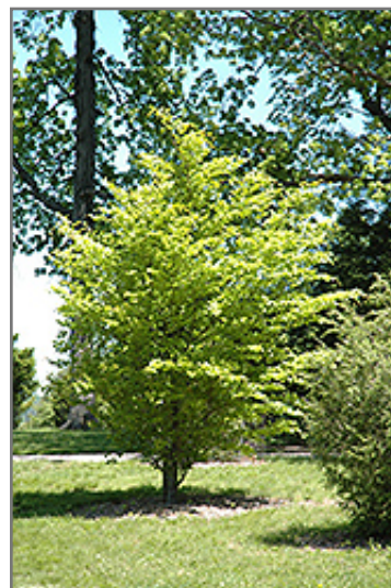
Golden Beech

Golden Beech is recommended for the following landscape applications;