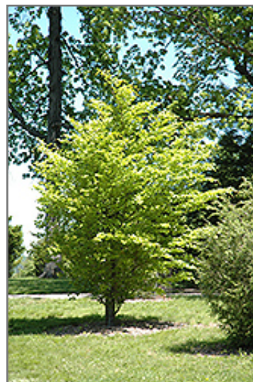
Golden Beech

Golden Beech is recommended for the following landscape applications;