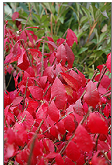
Burning Bush (tree form) in fall