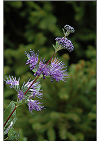
Blue Mist Caryopteris flowers

Blue Mist Caryopteris is recommended for the following landscape applications;