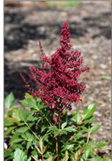
Red Sentinel Astilbe flowers

Red Sentinel Astilbe is a fine choice for the garden, but it is also a good selection for planting in outdoor pots and containers. With its upright habit of growth, it is best suited for use as a 'thriller' in the 'spiller-thriller-filler' container combination; plant it near the center of the pot, surrounded by smaller plants and those that spill over the edges. Note that when growing plants in outdoor containers and baskets, they may require more frequent waterings than they would in the yard or garden.