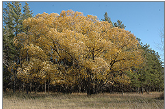
White Willow in fall

White Willow is recommended for the following landscape applications;