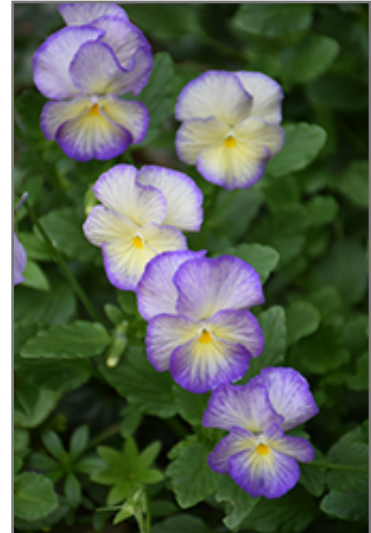
Etain Pansy flowers

Etain Pansy is recommended for the following landscape applications;