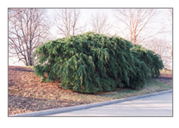
Sargent's Weeping Hemlock