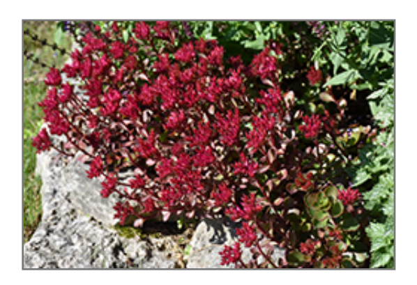
Voodoo Stonecrop in bloom

Voodoo Stonecrop is recommended for the following landscape applications;