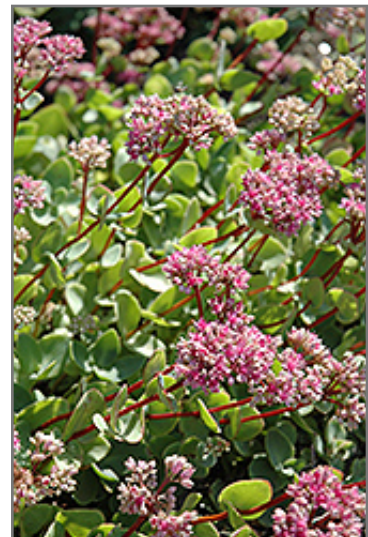
October Daphne flowers