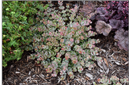
October Daphne

October Daphne is recommended for the following landscape applications;