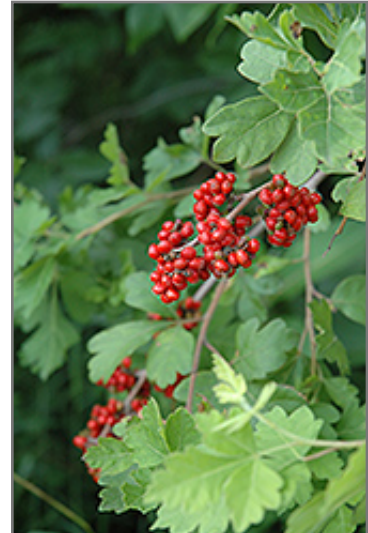
Fragrant Sumac fruit