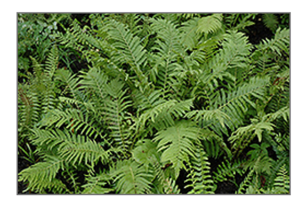
Christmas Fern