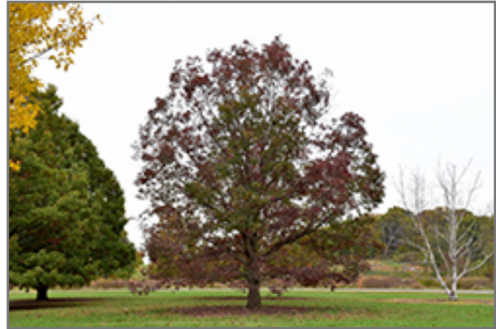
White Oak in fall Photo courtesy of NetPS Plant Finder

White Oak will grow to be about 90 feet tall at maturity, with a spread of 70 feet. It has a high canopy of foliage that sits well above the ground, and should not be planted underneath power lines. As it matures, the lower branches of this tree can be strategically removed to create a high enough canopy to support unobstructed human traffic underneath. It grows at a slow rate, and under ideal conditions can be expected to live to a ripe old age of 300 years or more; think of this as a heritage tree for future generations!