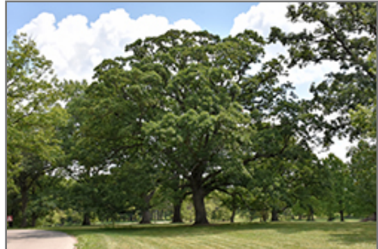
White Oak