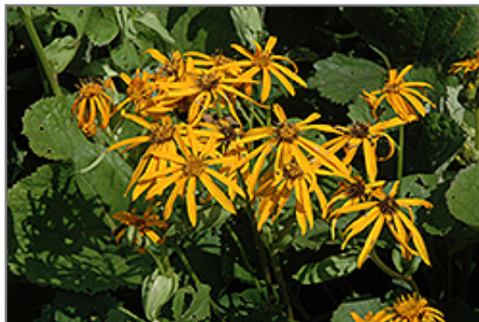
Othello Rayflower flowers