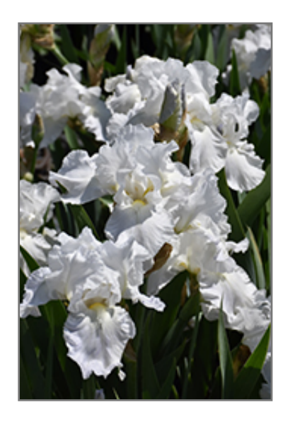
Immortality Iris flowers

Immortality Iris features bold white flag-like flowers with a buttery yellow beard at the ends of the stems in mid spring. The flowers are excellent for cutting. Its sword-like leaves remain green in colour throughout the season.