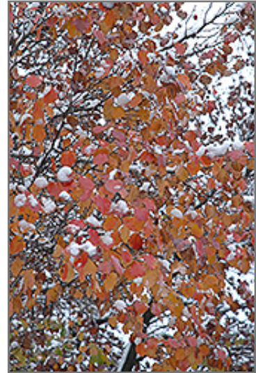
Bradford Ornamental Pear in fall

This plant is not reliably hardy in our region, and certain restrictions may apply; contact the store for more information.