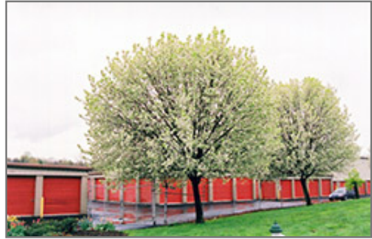
Bradford Ornamental Pear in bloom