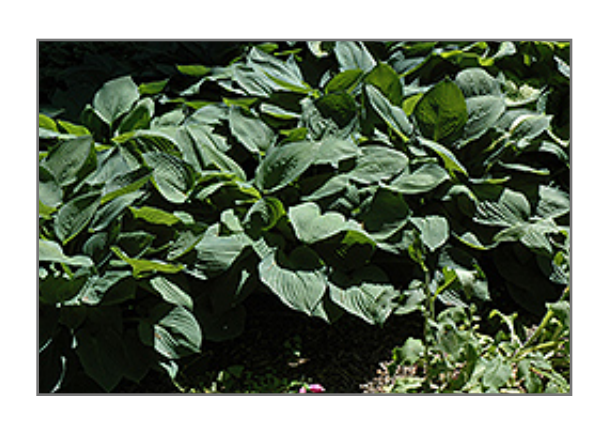
Hyacinthina Hosta

A wonderful variety perfect for mass planting or borders; ribbed, grey green foliage add texture and color to landscapes; fragrant, violet purple flowers bloom above foliage from mid summer to early fall; shade loving and easy to grow