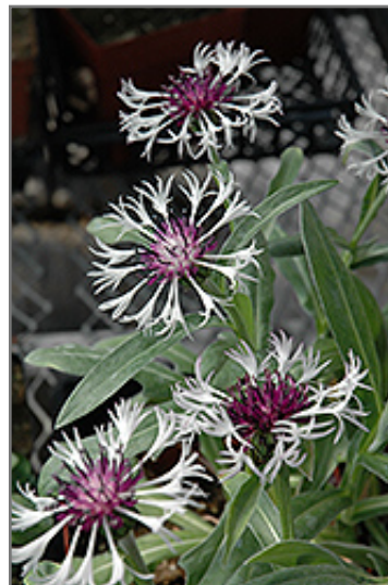
Amethyst In Snow Cornflower flowers

Amethyst In Snow Cornflower is recommended for the following landscape applications;