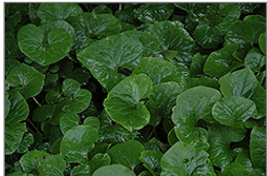
Canadian Wild Ginger