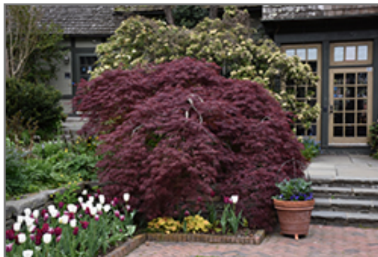
Tamukeyama Japanese Maple

Tamukeyama Japanese Maple is recommended for the following landscape applications;