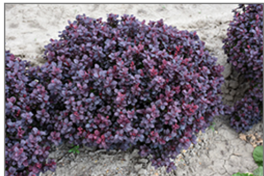
Concorde Japanese Barberry