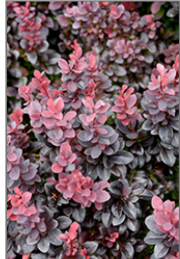
Concorde Japanese Barberry foliage

Concorde Japanese Barberry is recommended for the following landscape applications;