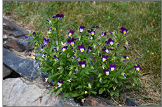
Johnny Jump-Up in bloom

Johnny Jump-Up will grow to be only 4 inches tall at maturity extending to 6 inches tall with the flowers, with a spread of 6 inches. When grown in masses or used as a bedding plant, individual plants should be spaced approximately 5 inches apart. It grows at a fast rate, and tends to be biennial, meaning that it puts on vegetative growth the first year, flowers the second, and then dies. However, this species tends to self-seed and will thereby endure for years in the garden if allowed. As an herbaceous perennial, this plant will usually die back to the crown each winter, and will regrow from the base each spring. Be careful not to disturb the crown in late winter when it may not be readily seen!