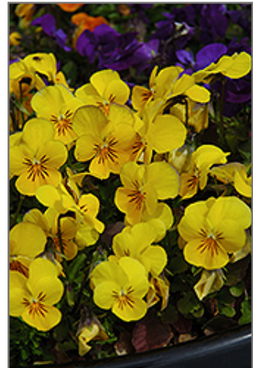
Penny Yellow Pansy flowers

This plant will require occasional maintenance and upkeep, and should only be pruned after flowering to avoid removing any of the current season's flowers. Deer don't particularly care for this plant and will usually leave it alone in favor of tastier treats. Gardeners should be aware of the following characteristic(s) that may warrant special consideration;