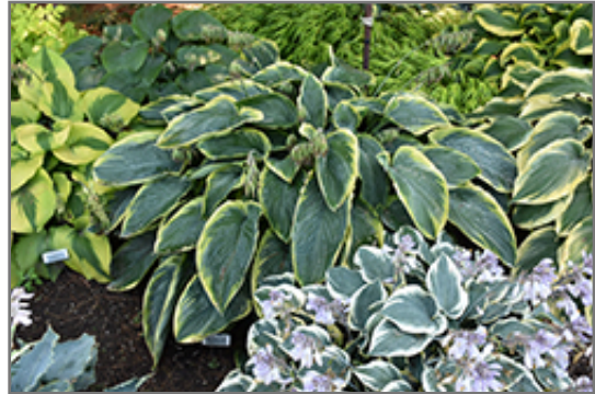
Shadowland Wu-La-La Hosta

Shadowland Wu-La-La Hosta is a dense herbaceous perennial with a mounded form. Its medium texture blends into the garden, but can always be balanced by a couple of finer or coarser plants for an effective composition.