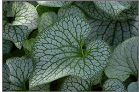
Sterling Silver Bugloss foliage

Sterling Silver Bugloss will grow to be about 12 inches tall at maturity, with a spread of 24 inches. When grown in masses or used as a bedding plant, individual plants should be spaced approximately 20 inches apart. It grows at a medium rate, and under ideal conditions can be expected to live for approximately 10 years. As an herbaceous perennial, this plant will usually die back to the crown each winter, and will regrow from the base each spring. Be careful not to disturb the crown in late winter when it may not be readily seen!