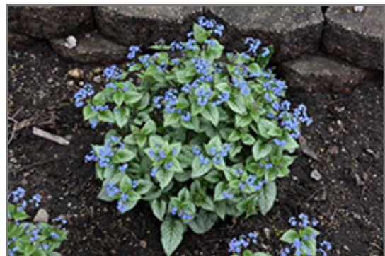
Sterling Silver Bugloss in bloom