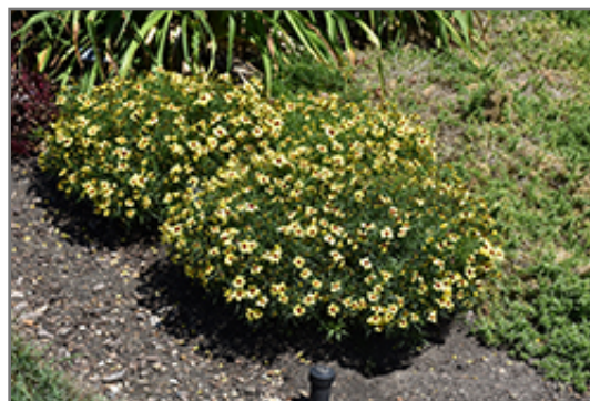
Sizzle And Spice Sassy Saffron Tickseed in bloom