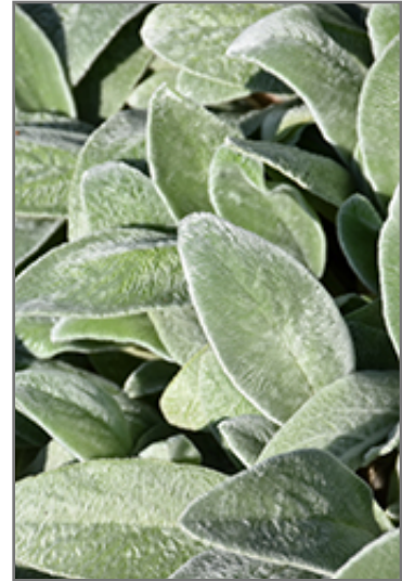
Lamb's Ears foliage