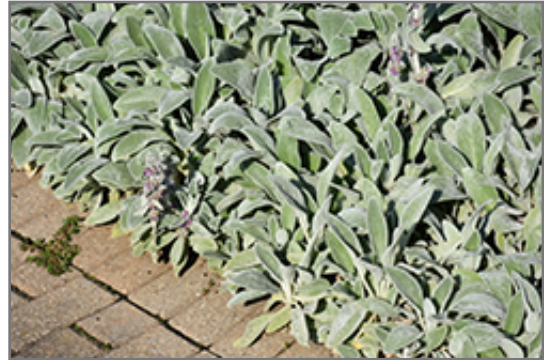
Lamb's Ears

* This is a 'special order' plant - contact store for details