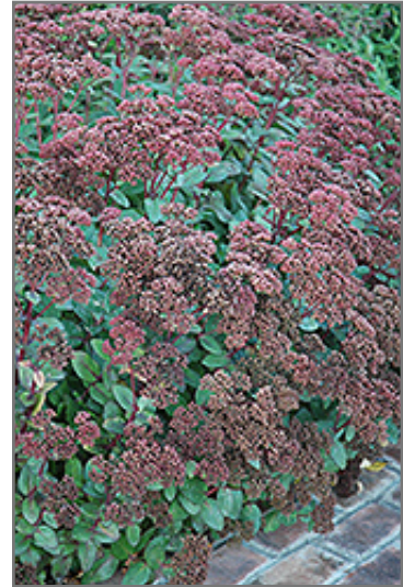
Matrona Stonecrop flowers

Matrona Stonecrop is recommended for the following landscape applications;