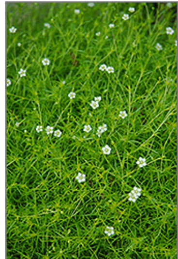
Scotch Moss flowers