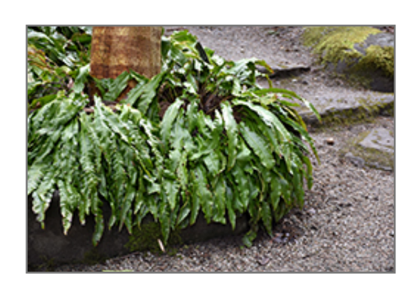
Hart's Tongue Fern

This variety is unusual in that it has simple, undivided fronds that are up to 2 feet long; yellowish and stunted in full sun; luxurious green foliage is a welcome addition to the garden as a groundcover