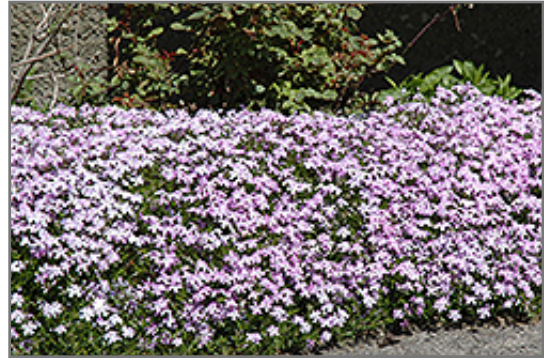
Emerald Blue Moss Phlox in bloom

Emerald Blue Moss Phlox will grow to be only 4 inches tall at maturity, with a spread of 18 inches. When grown in masses or used as a bedding plant, individual plants should be spaced approximately 15 inches apart. Its foliage tends to remain low and dense right to the ground. It grows at a medium rate, and under ideal conditions can be expected to live for approximately 10 years. As an evergreen perennial, this plant will typically keep its form and foliage year-round.