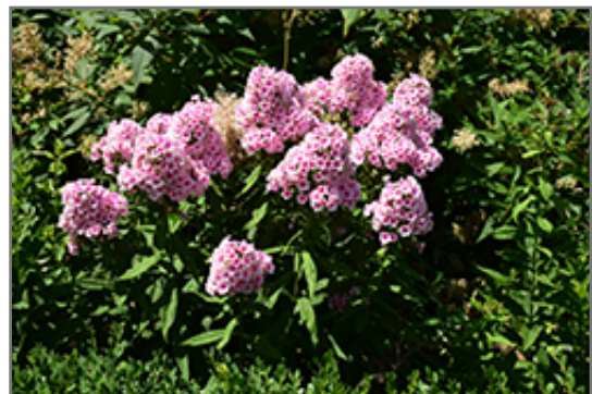
Bright Eyes Garden Phlox in bloom