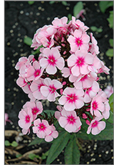
Bright Eyes Garden Phlox flowers

Bright Eyes Garden Phlox is a fine choice for the garden, but it is also a good selection for planting in outdoor pots and containers. With its upright habit of growth, it is best suited for use as a 'thriller' in the 'spiller-thriller-filler' container combination; plant it near the center of the pot, surrounded by smaller plants and those that spill over the edges. It is even sizeable enough that it can be grown alone in a suitable container. Note that when growing plants in outdoor containers and baskets, they may require more frequent waterings than they would in the yard or garden.