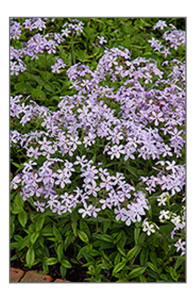
Woodland Phlox flowers