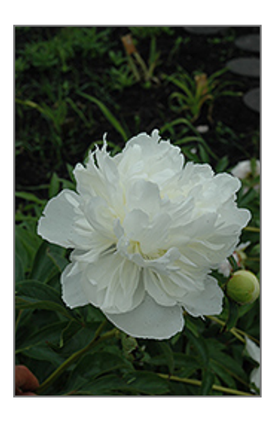
Gardenia Peony flowers

Gardenia Peony will grow to be about 30 inches tall at maturity, with a spread of 3 feet. When grown in masses or used as a bedding plant, individual plants should be spaced approximately 30 inches apart. The flower stalks can be weak and so it may require staking in exposed sites or excessively rich soils. It grows at a slow rate, and under ideal conditions can be expected to live for approximately 20 years. As an herbaceous perennial, this plant will usually die back to the crown each winter, and will regrow from the base each spring. Be careful not to disturb the crown in late winter when it may not be readily seen!