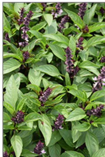
Sweet Basil flowers

This plant is typically grown in a designated herb garden. It should only be grown in full sunlight. It prefers to grow in average to moist conditions, and shouldn't be allowed to dry out. It is not particular as to soil type or pH. It is somewhat tolerant of urban pollution. This species is not originally from North America.