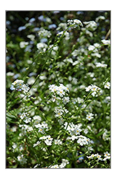
Alba Forget-Me-Not flowers