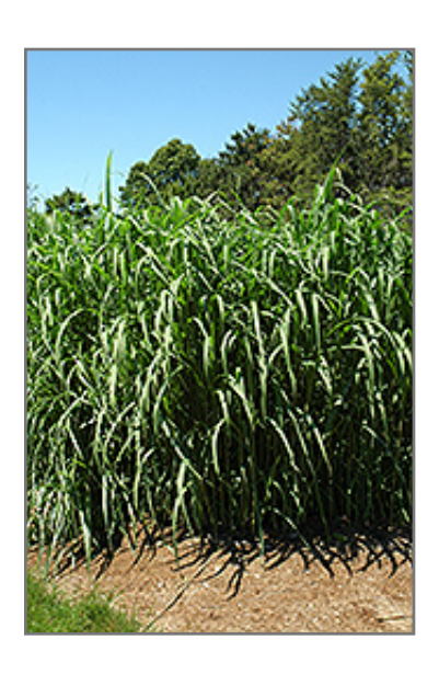
Giant Silver Grass