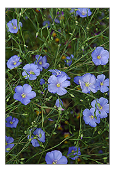
Perennial Flax flowers