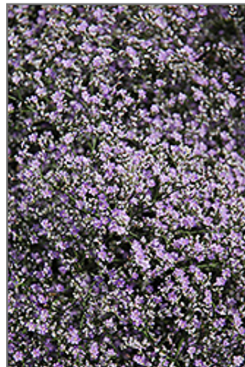
Sea Lavender flowers