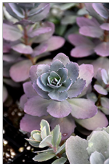
Plum Dazzled Stonecrop foliage