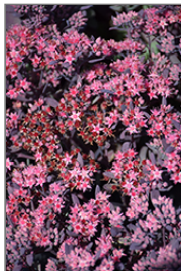
Plum Dazzled Stonecrop flowers

Plum Dazzled Stonecrop is a dense herbaceous perennial with an upright spreading habit of growth. Its medium texture blends into the garden, but can always be balanced by a couple of finer or coarser plants for an effective composition.