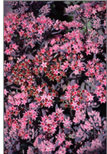
Plum Dazzled Stonecrop flowers

Plum Dazzled Stonecrop is a dense herbaceous perennial with an upright spreading habit of growth. Its medium texture blends into the garden, but can always be balanced by a couple of finer or coarser plants for an effective composition.