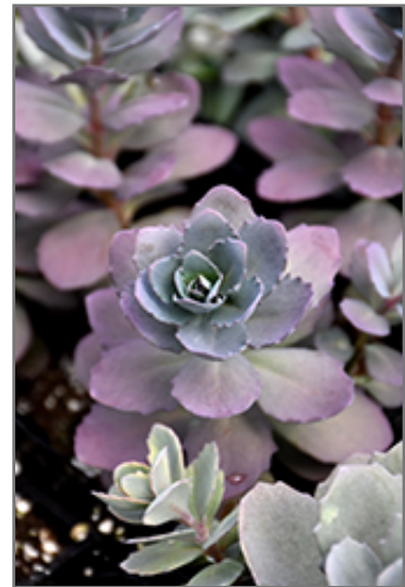
Plum Dazzled Stonecrop foliage