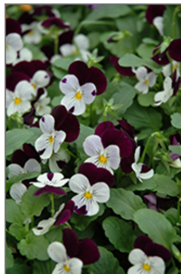
Sorbet XP White Jump Up Pansy flowers

This plant will require occasional maintenance and upkeep, and should only be pruned after flowering to avoid removing any of the current season's flowers. Deer don't particularly care for this plant and will usually leave it alone in favor of tastier treats. Gardeners should be aware of the following characteristic(s) that may warrant special consideration;