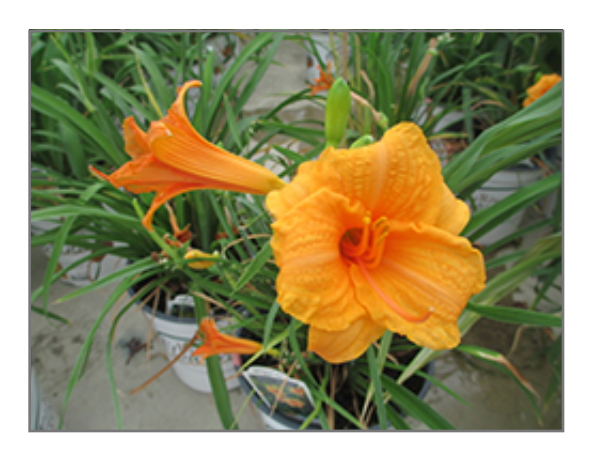
Endlesslily Orange Daylily flowers