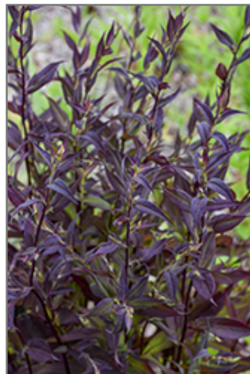
Lady In Black Calico Aster