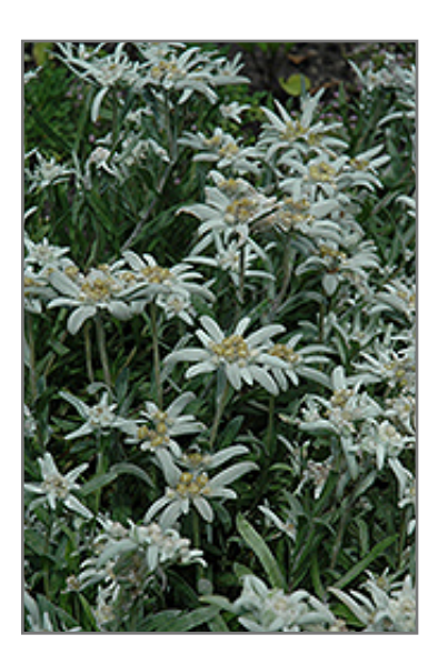
Alpine Edelweiss flowers

This plant does best in full sun to partial shade. It prefers dry to average moisture levels with very well-drained soil, and will often die in standing water. It is considered to be drought-tolerant, and thus makes an ideal choice for a low-water garden or xeriscape application. It is particular about its soil conditions, with a strong preference for poor, alkaline soils. It is somewhat tolerant of urban pollution. This species is not originally from North America. It can be propagated by division.