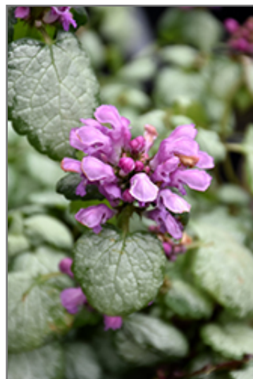
Red Nancy Spotted Dead Nettle flowers