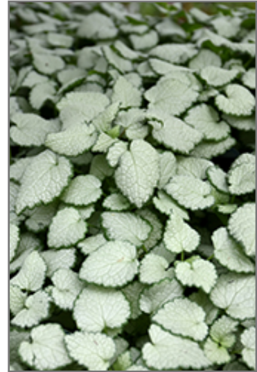
Red Nancy Spotted Dead Nettle foliage

Red Nancy Spotted Dead Nettle is a fine choice for the garden, but it is also a good selection for planting in outdoor pots and containers. Because of its spreading habit of growth, it is ideally suited for use as a 'spiller' in the 'spiller-thriller-filler' container combination; plant it near the edges where it can spill gracefully over the pot. Note that when growing plants in outdoor containers and baskets, they may require more frequent waterings than they would in the yard or garden.