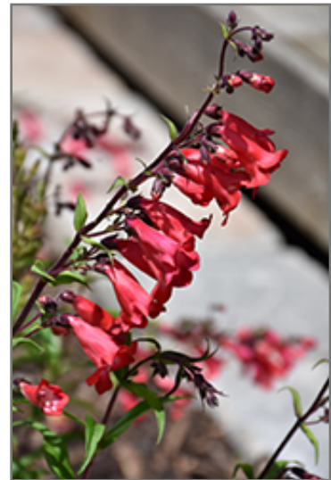
Cherry Sparks Beard Tongue flowers