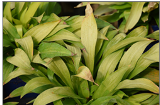
Munchkin Fire Hosta foliage