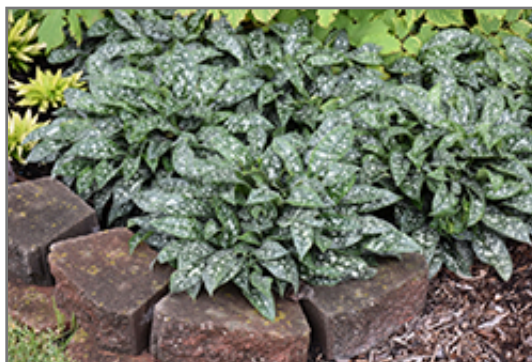
Twinkle Toes Lungwort

Twinkle Toes Lungwort will grow to be about 12 inches tall at maturity, with a spread of 18 inches. When grown in masses or used as a bedding plant, individual plants should be spaced approximately 15 inches apart. Its foliage tends to remain dense right to the ground, not requiring facer plants in front. It grows at a medium rate, and under ideal conditions can be expected to live for approximately 10 years. As an herbaceous perennial, this plant will usually die back to the crown each winter, and will regrow from the base each spring. Be careful not to disturb the crown in late winter when it may not be readily seen!