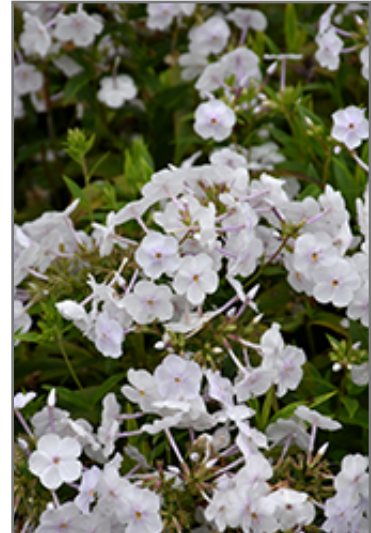
Fashionably Early Crystal Garden Phlox flowers